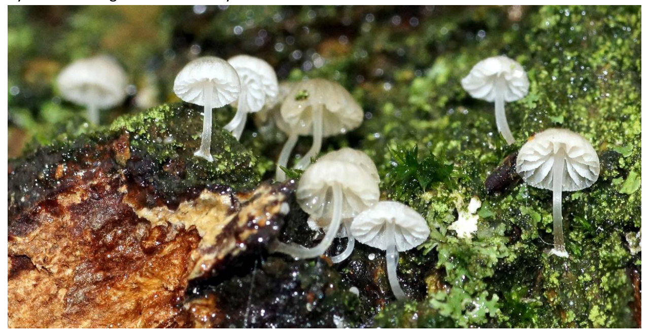
Above, the tiny fruitbodies of Mycena clavularis , each cap being only 5mm across at most. The characteristic disc at the stem base can be seen on several specimens.

We ended up with ten different species of Mycena (Bonnets) on the list, all species of fallen wood or woody litter apart from the grassland species already mentioned above. The tiny white species proved to be the most interesting when I worked through them at home: M . adscendens (Frosty Bonnet) has a cap and stem covered as if sprinkled with icing sugar, has a small disc at the stem base and can quite often be found on woody debris. This appears to be the first time we've found it here and we thought we'd found several collections of it. However, when I checked one collection of these tiny fruitbodies which I'd found growing at eye-level on the bark of a deciduous tree (I omitted to make a note of which, unfortunately) it proved to be a much rarer species. This was M . clavularis (no common name); it looks very similar to M . adscendens even to the extent of having a disk at the stem base but is a duller greyer white and grows in clusters on living deciduous bark and the microscopic features are very different. We have only two previous county records, the first back in 1978 from Ibstone by well-respected mycologists: collecter Roger Phillips and identifier Derek Reid, and the second from 2014 at Finemere collected by Nick Standing and identified by me!