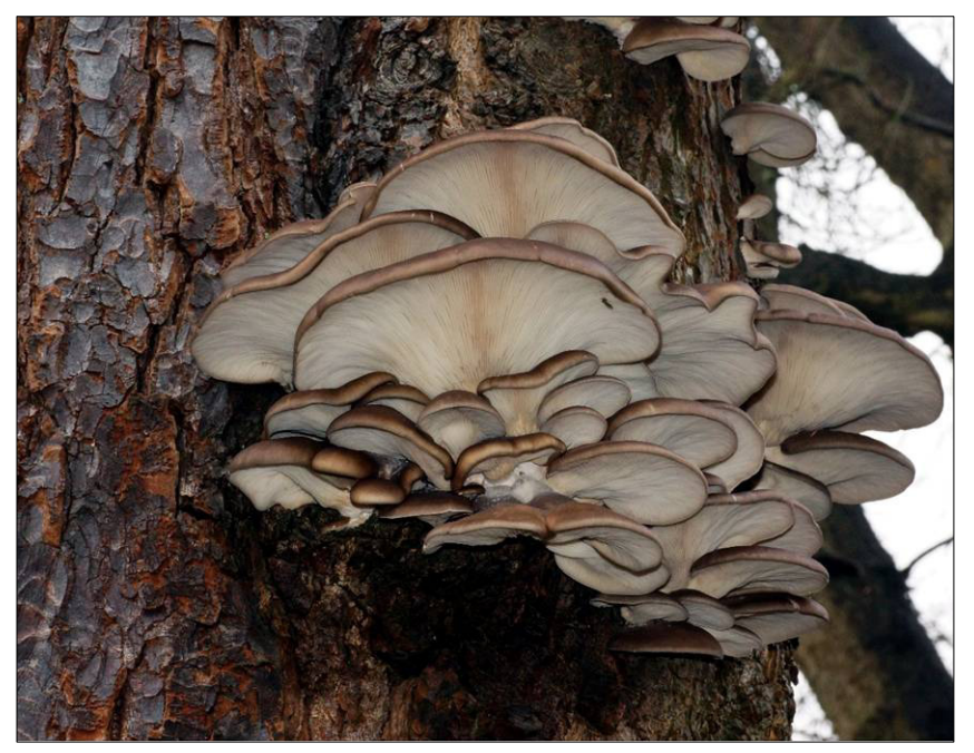
Incidentally, it appears that the correct name for Mycena adscendens is now Mycena tenerrima - yet another example of a name change we're going to have to get used to!

Moving further into the more wooded area with both Sweet and Horse Chestnut trees, we found splendid of Pleurotus examples ostreatus (Oyster Mushroom) prolifically growing on а standing trunk together with several other species.