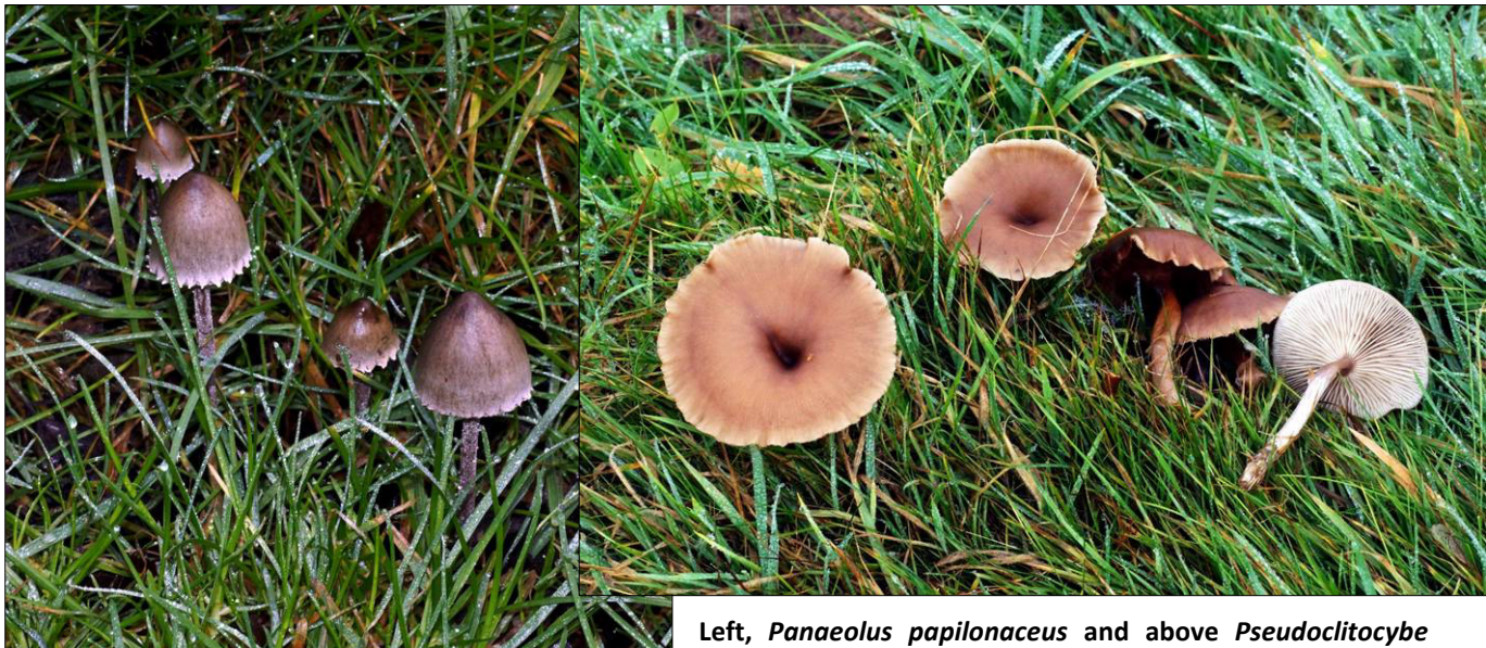
Left, Panaeolus papilonaceus and above Pseudoclitocybe cyathiformis , both found at the start of the morning (NS)

We started in the area of shorter grass grazed by sheep to the south of the road which crosses the common, and this proved more productive than that just to the north grazed by Dexters where the grass was considerably longer. Waxcaps were somewhat few and far between and had virtually finished fruiting, but there were good specimens of the frilly-edged Panaeolus papilionaceus (Petticoat Mottlegill) growing in the dung-enriched soil. Another eye-catching species we find regularly near the windmill at this time is Pseudoclitocybe cyathiformis (The Goblet) and there were good numbers of this to be seen here today.